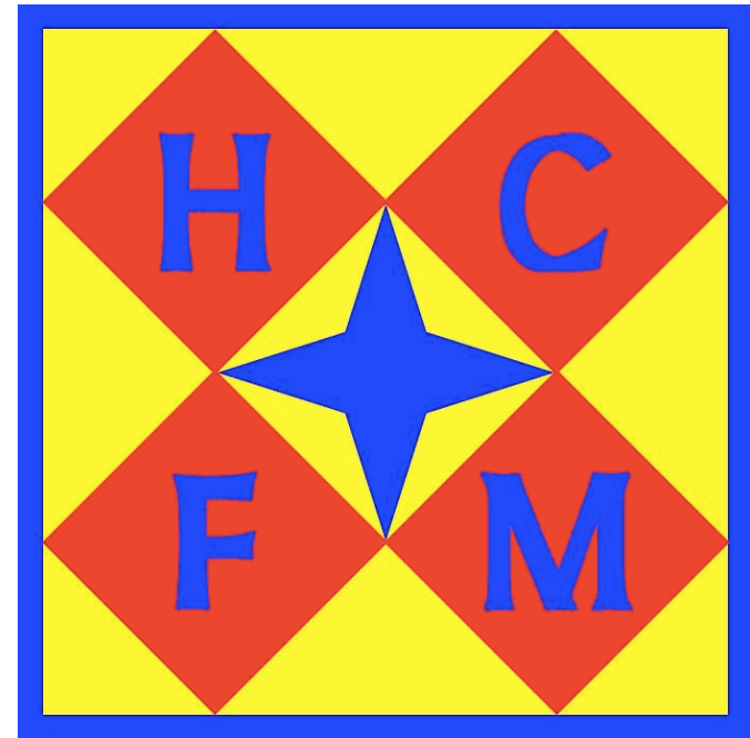
Harlan County Farmer's Market logo.