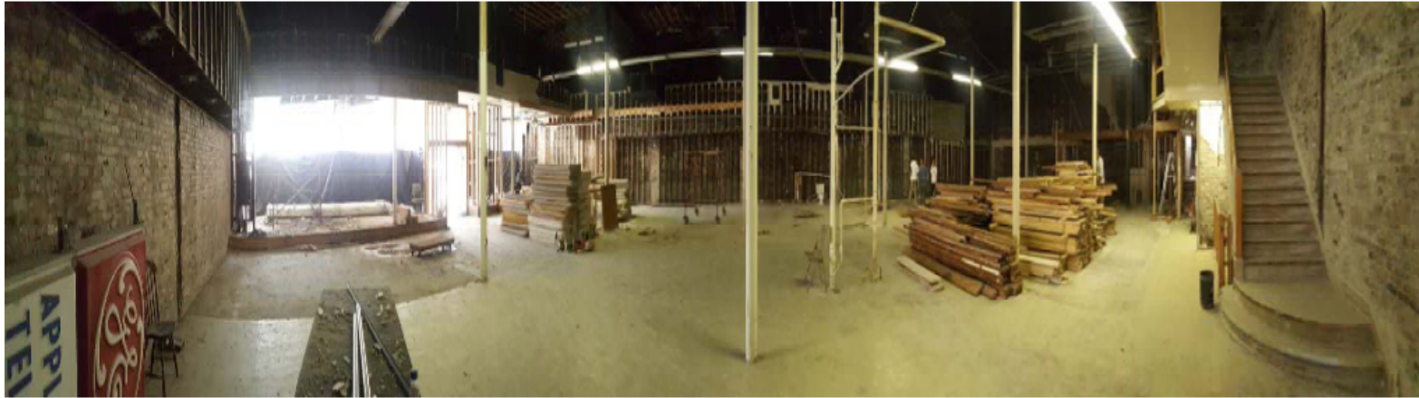
Distorted panoramic view inside the Belk building after demolition started.

To start a conversation or interview I introduced myself with my history and connections to the community. I then described the Belk building as it is today, talking about the ongoing work to clean it out and prepare it for renovation. I described the glass front, the open floors inside, the high ceilings and the exposed brick walls. I highlighted how this was a long term project and that the coalition was taking the time to engage the community in planning so that they could be assured that what went into the building was something that the community wanted and would be invested in. I described the Belk building as being a small part of a larger process of economic development and growth across Harlan County and the region. Then I listened.